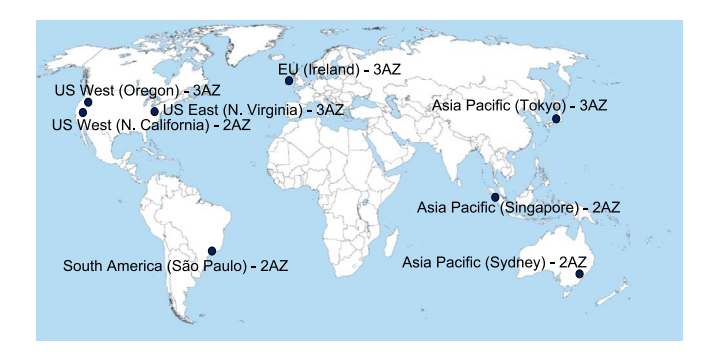
Fig. 1. Geographical redundancy and diversity of Amazon EC2's regions and availability zones.