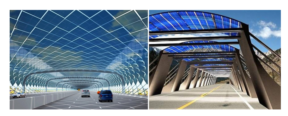
Fig. 1. Examples of possible Solar Roads

way the electricity flowing through the system. This management, consists in controlling the electricity flow by gathering information from all the participants of the grid: the suppliers and the consumers. In Europe, Smart grid policy is organized as the Smart Grid European Technology Platform.<sup>2</sup>